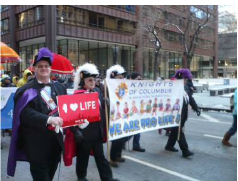
Chicago MFL Knights