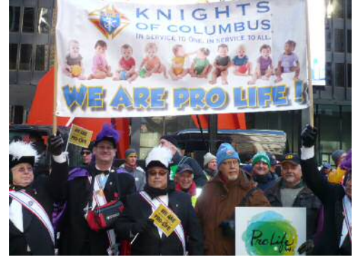
Chicago MFL Knights