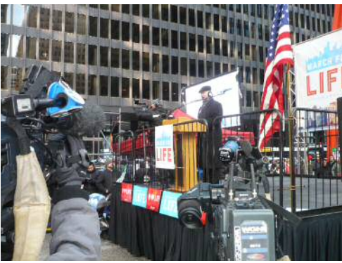
Cardinal Cupich speaking