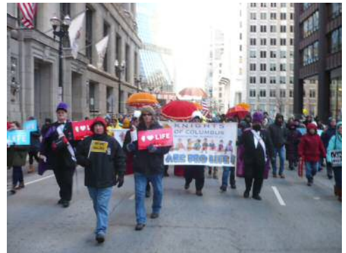
Chicago MFL Knights