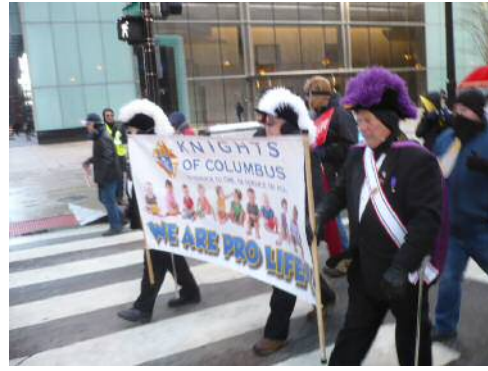
Chicago MFL Knights